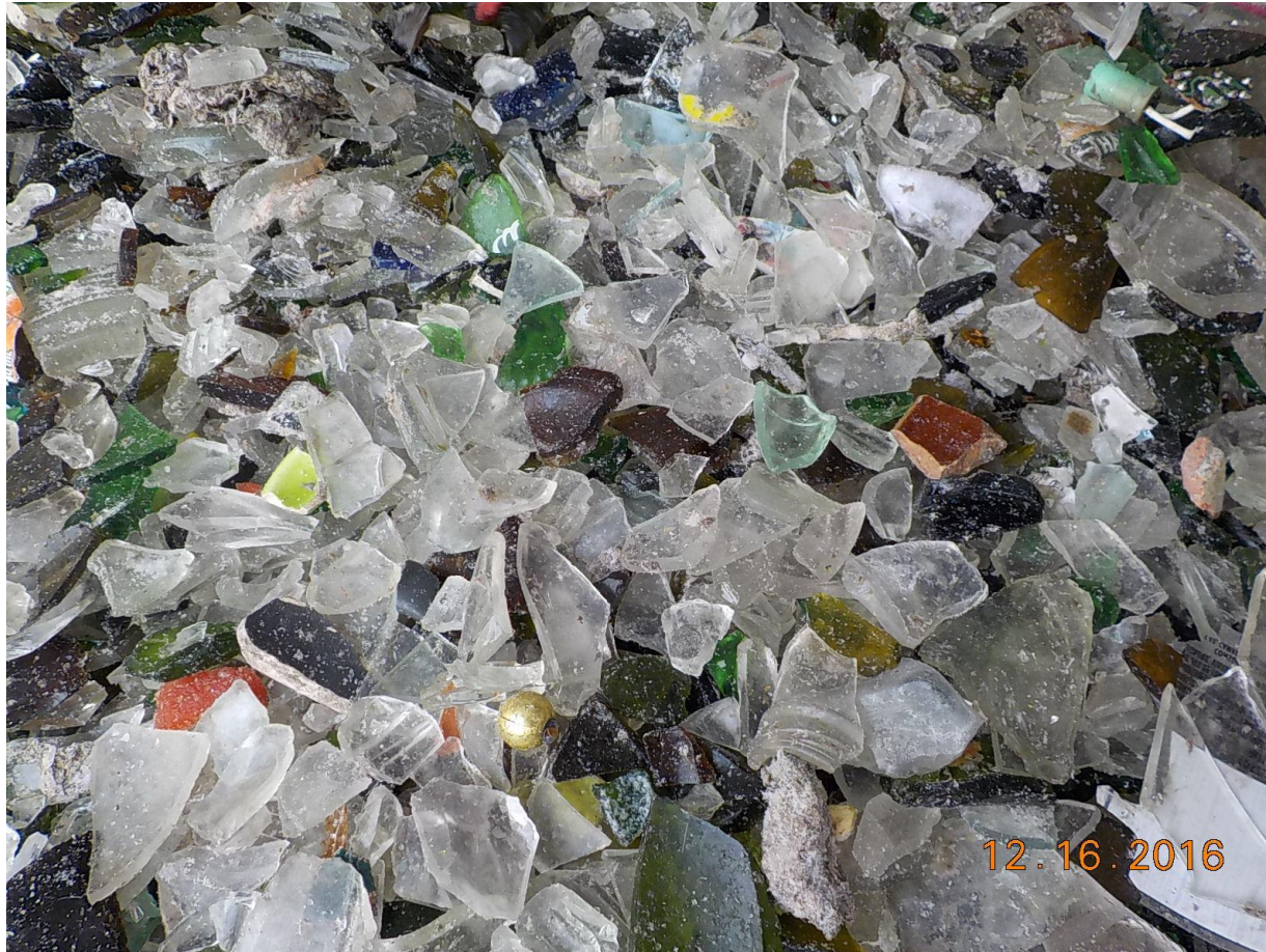
Clean Glass After The Installation Of The Glass Clean Up System