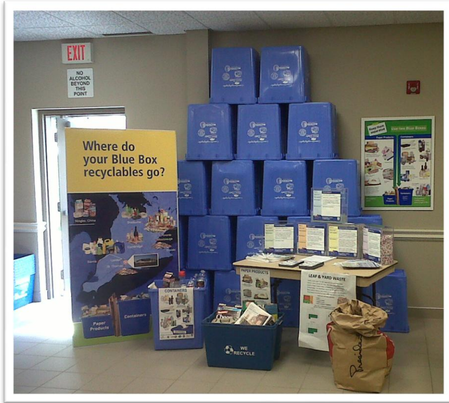
Display to promote new program